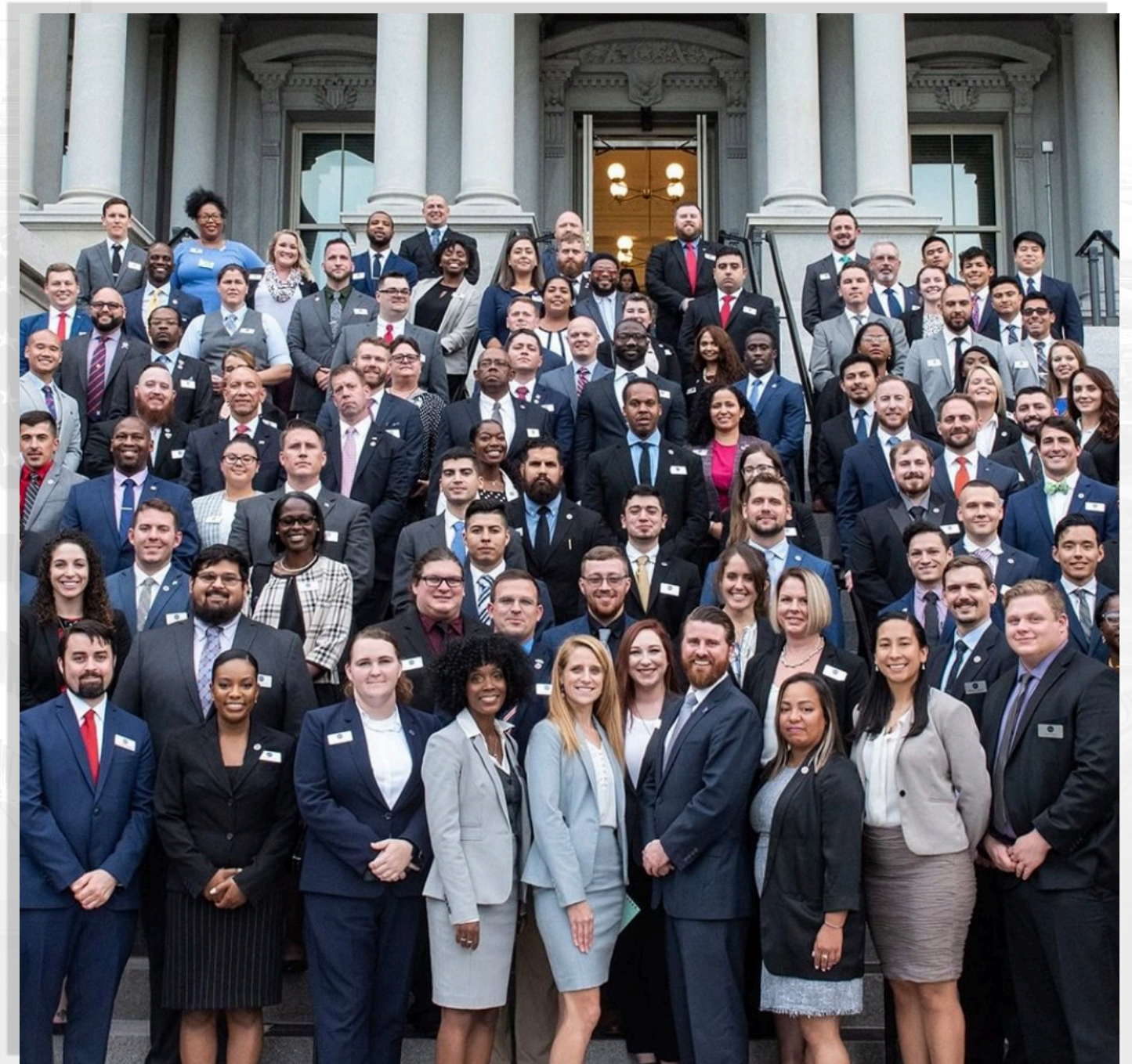
Working to get back to in-person programming after Covid, SVA is remembering the 2019 cohort or Leadership Fellows.

Empowering student veterans to lead and live their best lives.